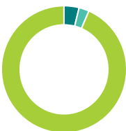
Asset allocation (%)