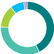
Asset allocation (%)