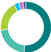
Asset allocation (%)