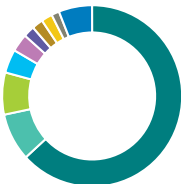
Geographic allocation (%)