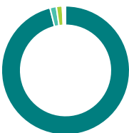
Asset allocation (%)