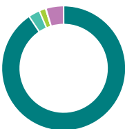
Geographic allocation (%)