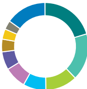
Geographic allocation (%)