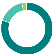
Geographic allocation (%)