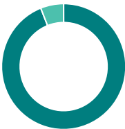
Geographic allocation (%)