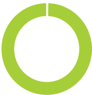
Asset allocation (%)